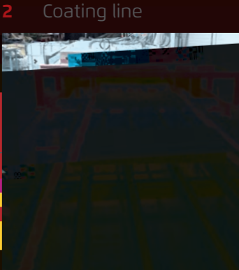
2 Coating line